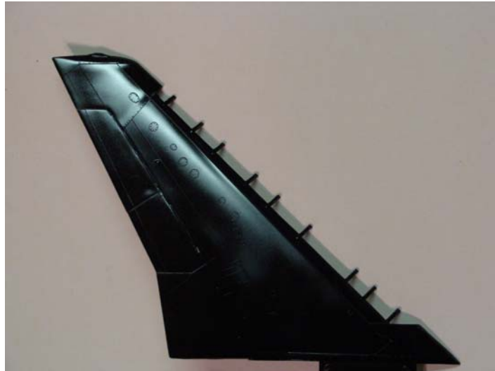
Nice & glossed up!

You could tint the various panels with pastels as I have begun to do. You can also tint panels with Sakura Pigma Micron pens or Faber-Castell Pitt artist pens. Sakura pens are available at most Hobby Lobby Stores. They make them in 12 different colors but Hobby Lobby only seems to have black. They range in size from 005 to a micro brush. I believe