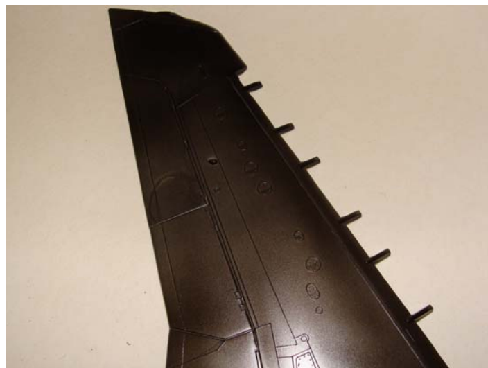
After 1 light coat of black

and continue to spray until everything is completely gloss. It is important to get a good coat of gloss. This will be the basis for your silver. The Tamiya Gloss Black will be super thin and it'll take several coats to get the model glossy. It will not build up and fill in the panel lines. Now this needs to dry for at least two to four hours. It would be good if you could let it dry over night. Once this is dry, it'll be silver time.